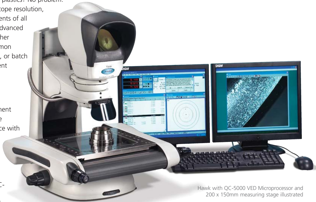
Hawk with QC-5000 VED Microprocessor and 200 x 150mm measuring stage illustrated

Hawk systems are available with a range of high specification, high performance measuring stage options, all manufactured to the highest tolerances providing a measuring range from 150mm x 150mm (6" x 6") up to 400mm x 300mm (16" x 12"). Every measuring stage has factory-completed non-linear error correction (NLEC) calibration to ensure optimum accuracy, which is traceable to national standards for the purposes of ISO9000. Combined with 0.5µm resolution measuring encoders, this provides a system repeatability of up to 2µm for complete confidence in your results. *