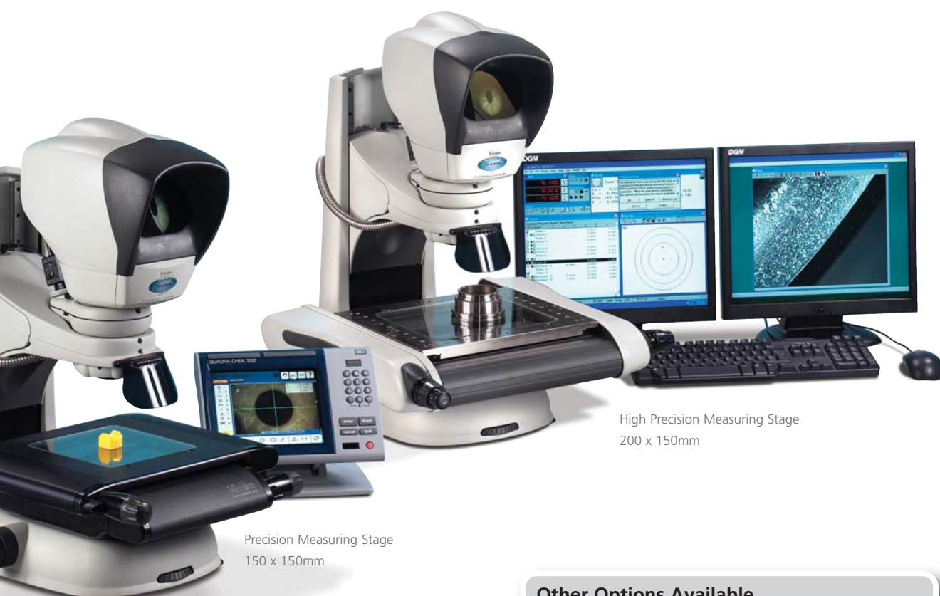
Precision Measuring Stage 150 x 150mm

Modular design provides full compatibility between surface and episcopic illumination units.