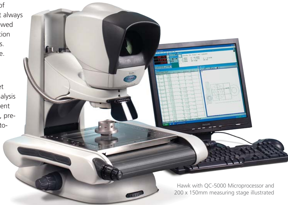
Hawk with QC-5000 Microprocessor and 200 x 150mm measuring stage illustrated

Hawk systems are available with a range of high specification, high performance measuring stage options, all manufactured to the highest tolerances providing a measuring range from 150mm x 150mm (6" x 6") up to 400mm x 300mm (16" x 12"). Every measuring stage has factory-completed non-linear error correction (NLEC) calibration to ensure optimum accuracy, which is traceable to national standards for the purposes of ISO9000. Combined with 0.5µm resolution measuring encoders, this provides a system repeatability of up to 2µm for complete confidence in your results.*