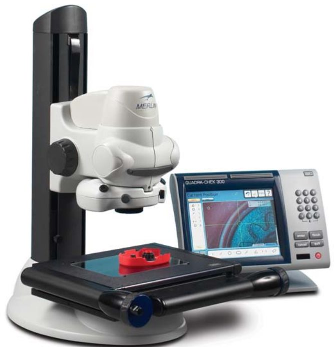
Merlin 2-axis Video Measurement System illustrated