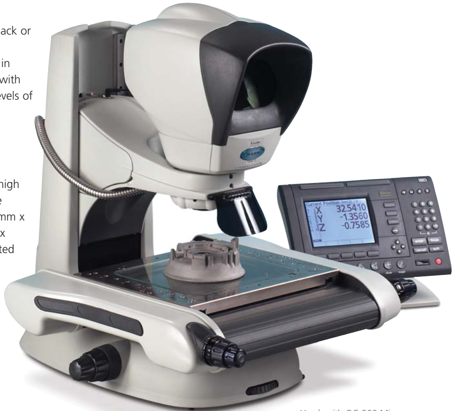
Hawk with QC-200 Microprocessor and 200 x 150mm measuring stage illustrated

Data processing is performed by the QC-200 multi-function microprocessor. QC-200 is ideal for measuring common component features, such as circles, angles, lines, arcs and distances and has been designed with ease of operation in mind, featuring an intuitive interface with meaningful visual displays. X, Y and Z measurements are represented in both numerical and graphical form with connectivity through USB and serial ports.