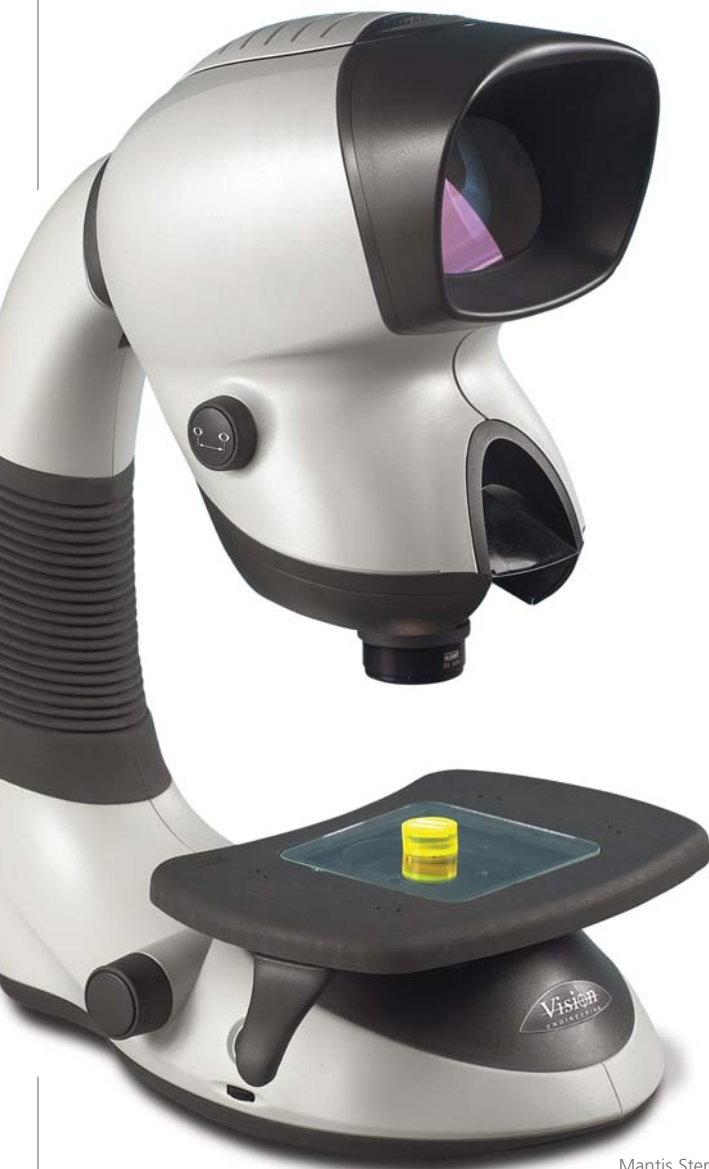
Mantis Stereo Inspection System illustrated

Vision Engineering holds world patents for a number of optical techniques which remove the need for conventional binocular microscope eyepieces. Dynascope™ image projection technology is employed in the Hawk family of non-contact measuring systems and offer users advanced ergonomics, superb optical clarity and reduced eyestrain leading to improved accuracy and productivity. Vision Engineering continues to lead the way in optical innovation and technology with ongoing research and development programmes.