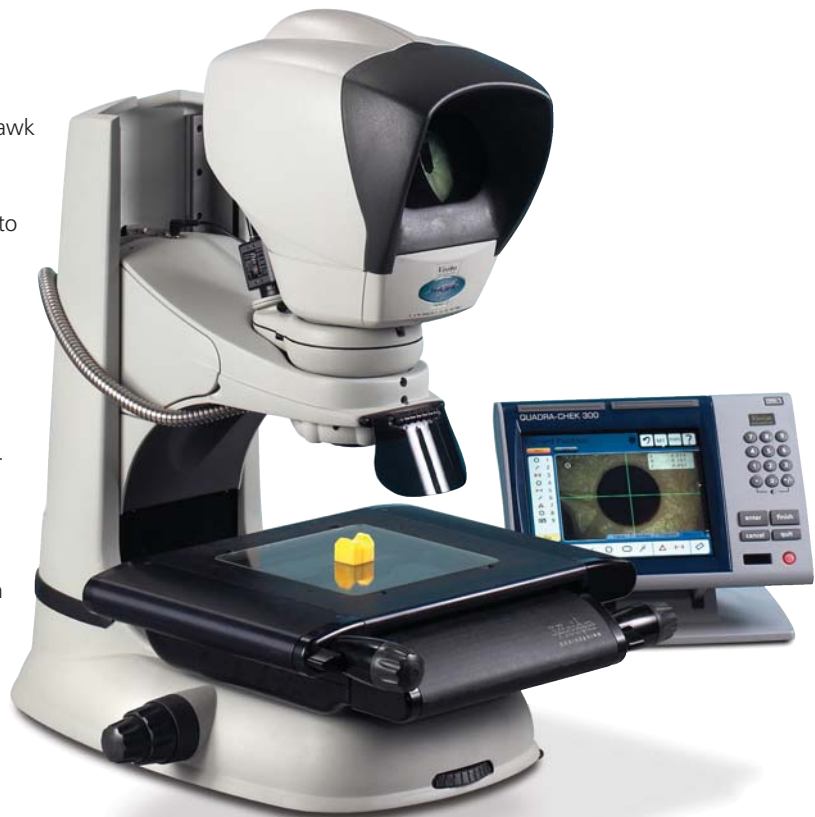
Hawk with QC-300 Microprocessor and 150 x 150mm measuring stage illustrated

Hawk with QC-300 is available with a range of high specification, high performance measuring stage options, providing a measuring range from 150mm x 150mm (6" x 6") up to 400mm x 300mm (16" x 12"). Every measuring stage has factory-completed non-linear error correction (NLEC) calibration to ensure optimum accuracy, which is traceable to national standards for the purposes of ISO9000. Combined with 0.5µm resolution measuring encoders, this provides a system repeatability of up to 2µm for complete confidence in your results.*