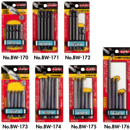
MG Magnetic "GIZA"notch Outer Ctn.:10, with one holder case