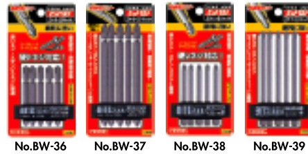
MG Magnetic Outer Ctn.:10, with one holder case NEW

Card size: (H × W) mm; (Thickness) : 23mm