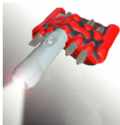
COBRA FLASH LIGHT