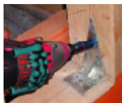
AUTO SCREW CATCH